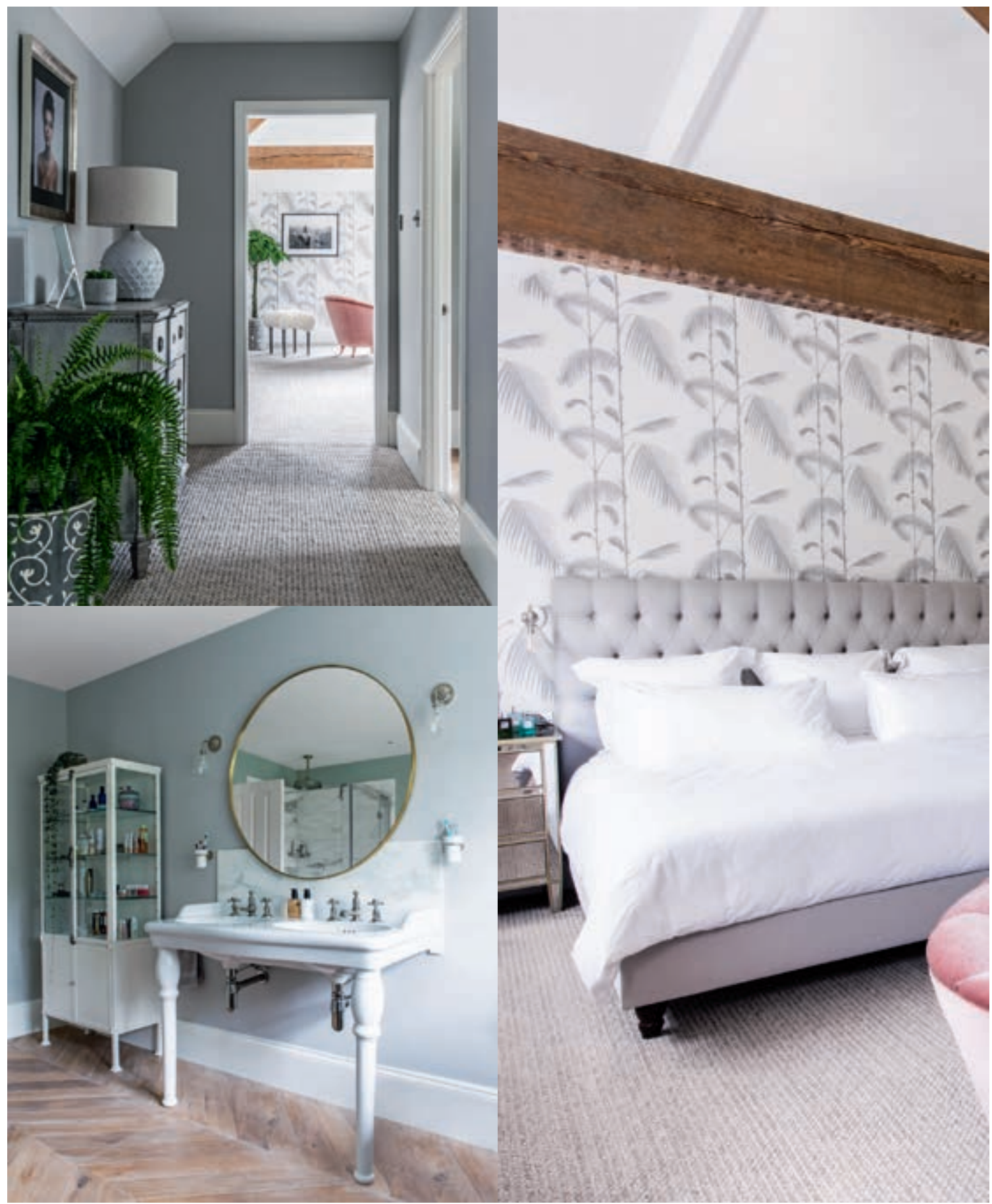
84 | H&G | DECEMBER 2017