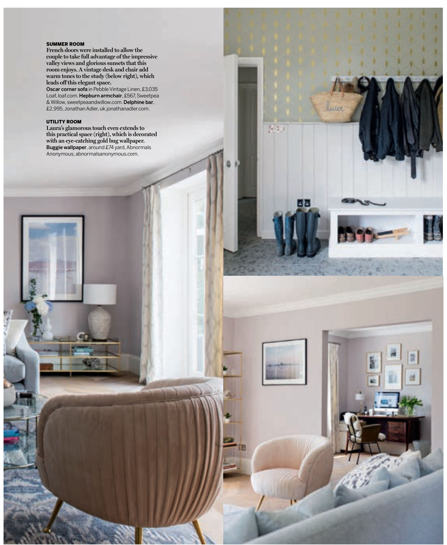
DECEMBER 2017 | H&G | 83