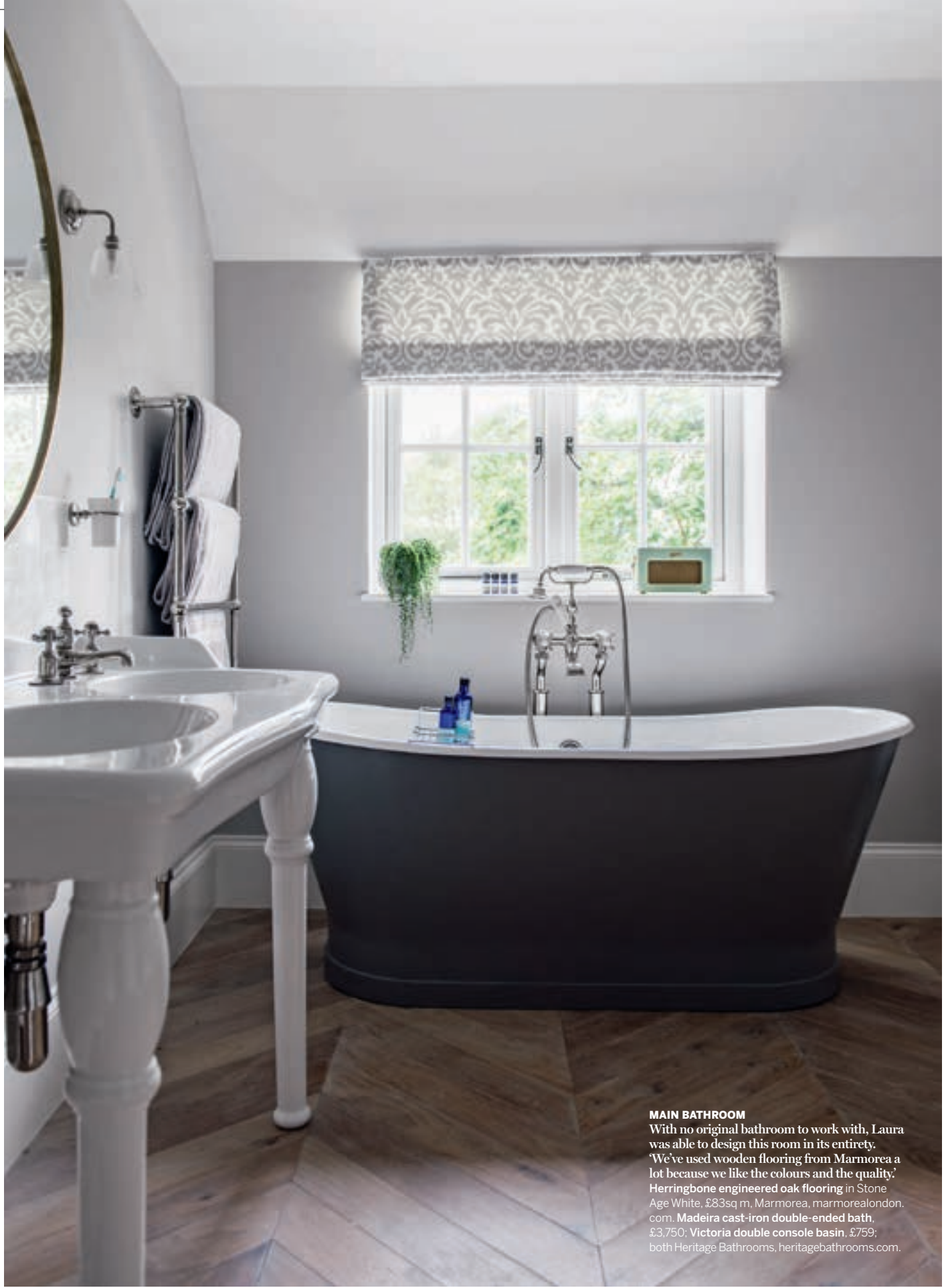
86 | H ଙ G | DECEMBER 2017