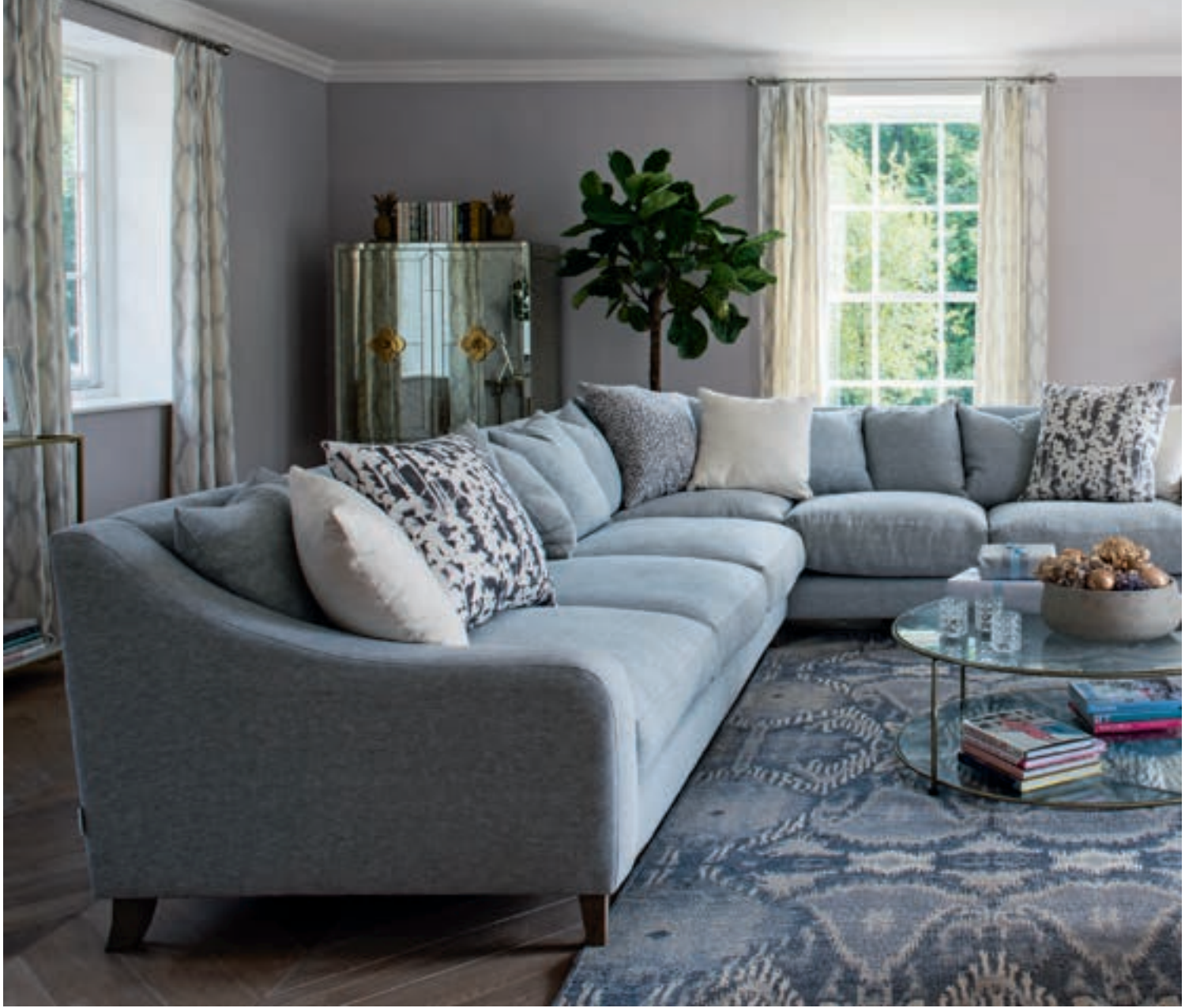
82 | H & G | DECEMBER 2017

How does your design process work? Once I have painted and papered a room, I add in the furniture; I usually get it right first time but in the summer room, I did have to send back two sofas before I felt I had achieved the look I wanted. My style is a mixture of 1960s Palm Springs, Scandinavian and contemporary country elegance with the occasional touch of Art Deco glamour thanks to the lighting. I err towards calm colours to create a soft and gentle atmosphere, except in the snug, where I plumped for an intense blue. I wanted a really cosy room for the winter and I hankered after a Zoffany paint called Prussian Blue that I had seen used in a restaurant. I tried it but it did not suit the space so I used Zoffany's Reign Blue instead; it has an amazing texture, a bit like velvet, and creates the perfect ambience.